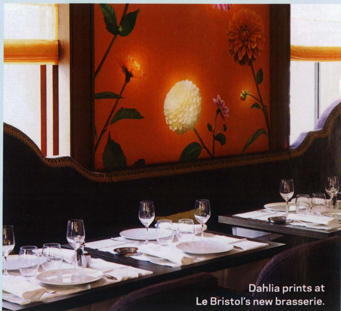
Dahlia prints at Le Bristol's new brasserie.