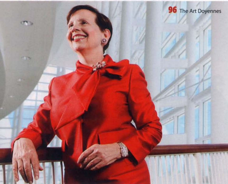
96 The Art Doyennes