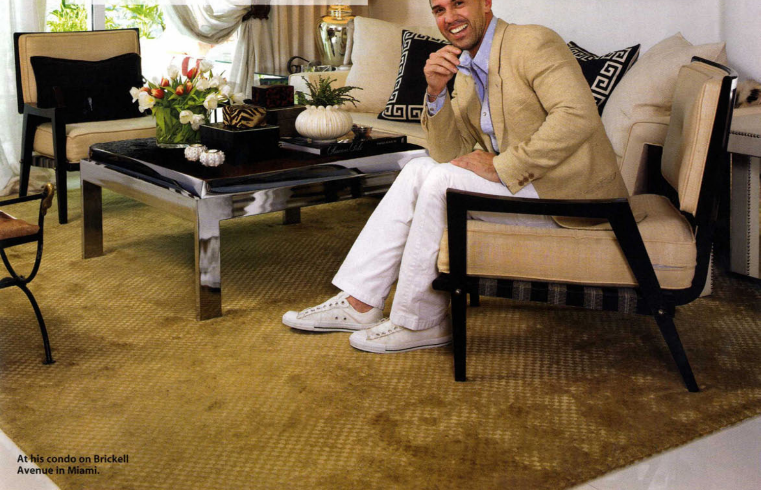
At his condo on Brickell Avenue in Miami.